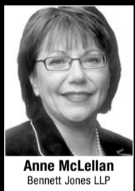
Anne McLellan Bennett Jones LLP