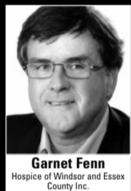
Garnet Fenn Hospice of Windsor and Essex County Inc.