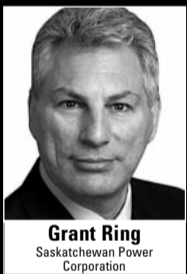
Grant Ring Saskatchewan Power Corporation